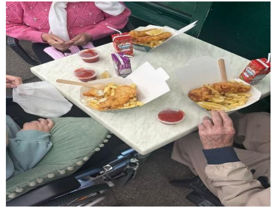
Fabulous Fish and Chips at the Harbor Café