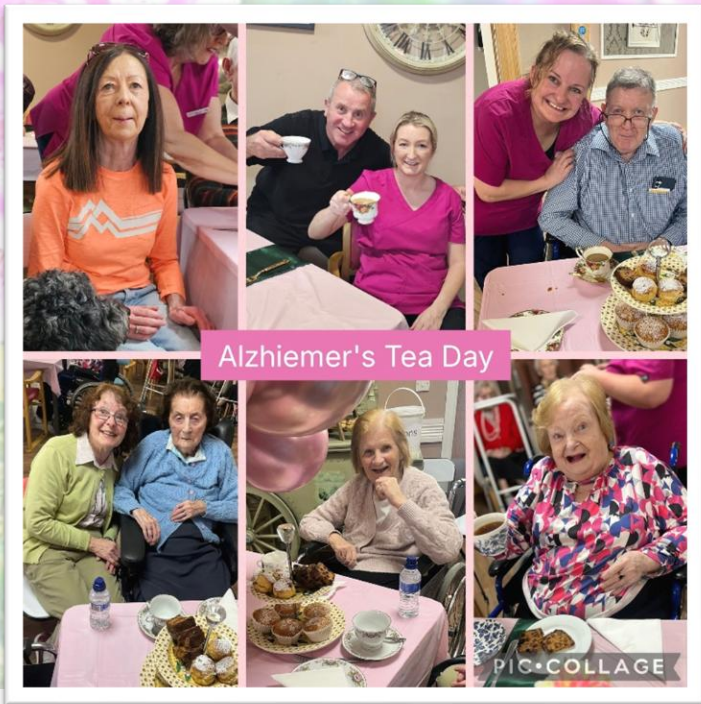
Alzheimer's Tea Day