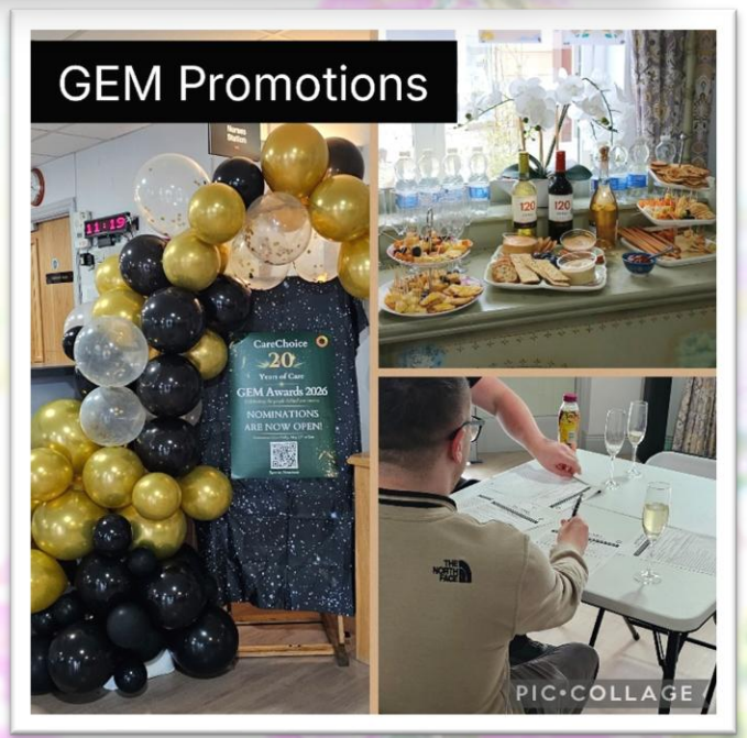
GEM Promotion Day