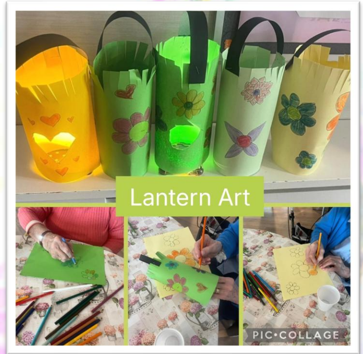
Art & Crafts