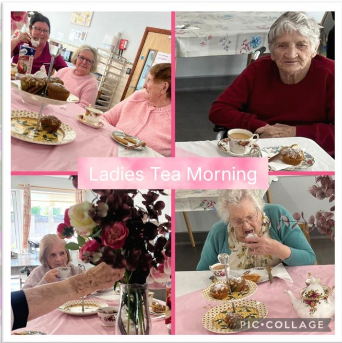
Ladies Tea Morning