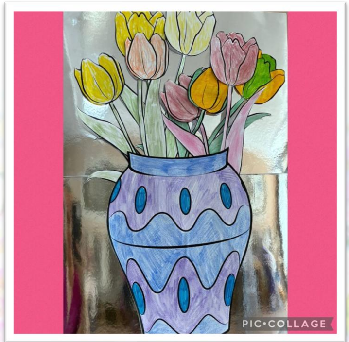
Art & Craft