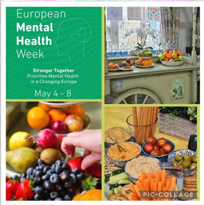
European Mental Health Awareness week