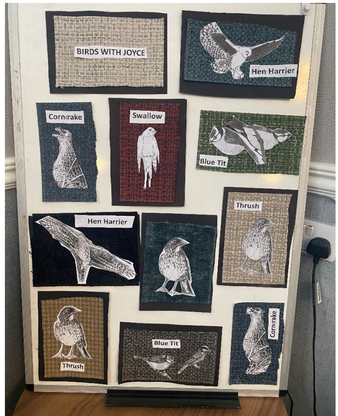
Sound of nature. Birdsong and bird collages with Joyce.