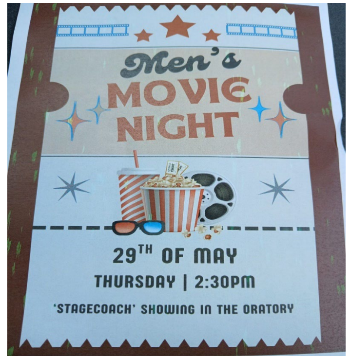
Men's Afternoon Movie - Stagecoach - A big hit!