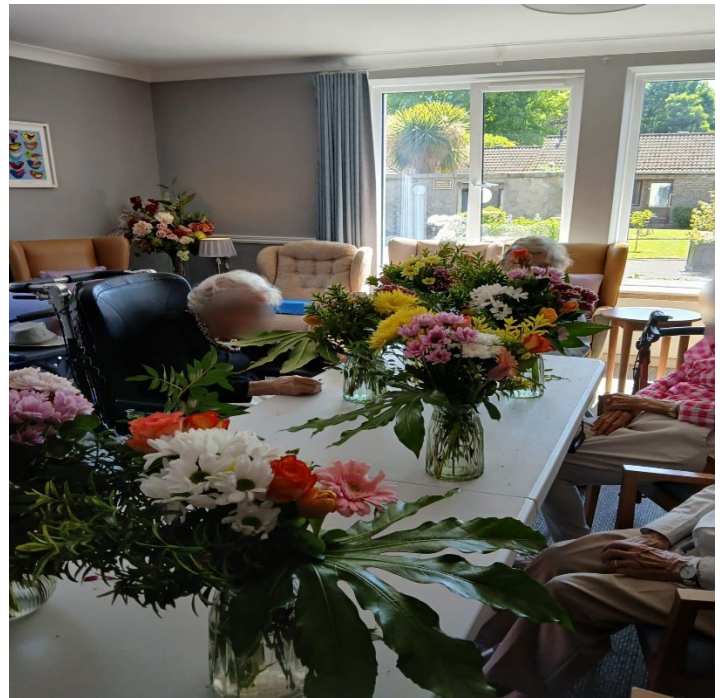
Our Ladies brought some colour into the home by making beautiful flower arrangements.